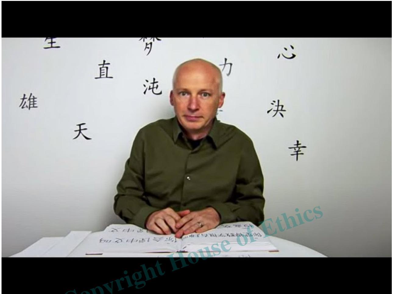
The Chinese Room Experiment | The Hunt for AI | BBC Studios

date créée octobre 21, 2021 Auteur katja-rausch