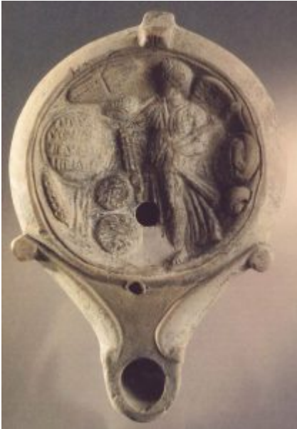
Inscription on a lamp found in Sepino (cf. A. Di Niro, Il museo sannitico di Campobasso. Catalogo della collezione provinciale , Pescara 2007, 162)